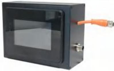
SLS280 - TS debugging instrument