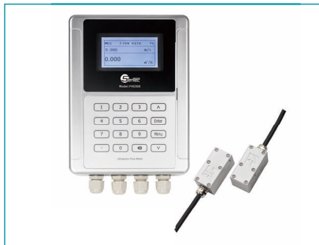
(Applicable temp.: -40°C ~ +130°C)