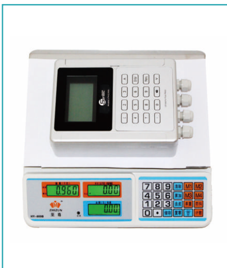
Transmitter weight: 0.96kg