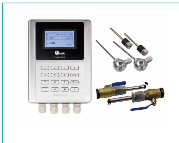
Insertion ultrasonic cold/heat flowmeter : FHS300-TT05-PT1000