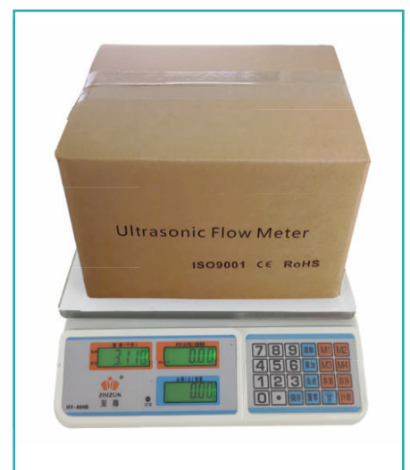
Gross weight: 3.11kg