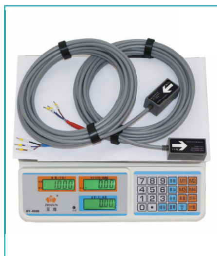
Transducer weight: 1.0kg