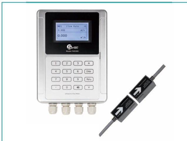
Clamp-on ultrasonic flowmeter: FHS300-TT01 (Applicable temp.: -40°C ~ +80°C)